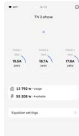
Ampere values screen

Here you can confirm that the same ampere values are displayed as on the Eastron meter. Ampere values can be found on the Eastron meter by clicking on [U / I] and scrolling to ampere values (A).